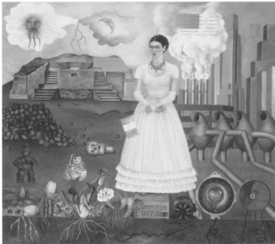
Fig. 6. Frida Kahlo, Self-Portrait on the Border between Mexico and the United States (1932), oil on canvas, 12½" x 13¾". Maria Reyero Collection.

Kahlo was keenly aware of the ability of clothing to communicate information about the tastes, principles, character, and moods of a nation. The Mexican Revolution itself had not created a sense of national identity, but subsequent political leaders tried to forge a model of national identity by initiating programs in education and the arts. Frida Kahlo fashioned her own interpretation of revolutionary ideology from remnants of Mexico’s