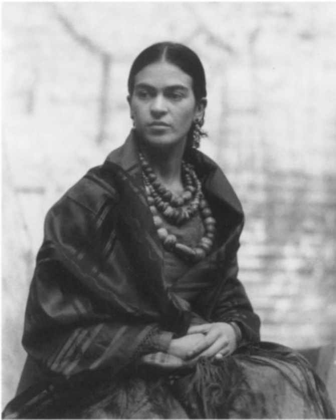
Fig. 1. Edward Weston, Portrait of Frida Kahlo (1930), photograph.