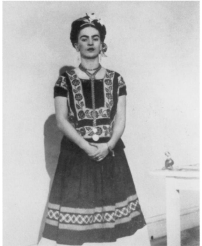
Fig. 4. Dora Maar, Portrait of Frida Kahlo (1939), photograph.