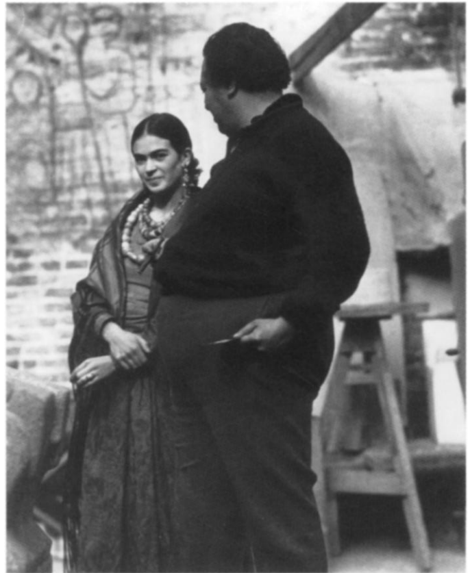
Fig. 2. Edward Weston, Portrait of Frida Kahlo and Diego Rivera (1930), photograph. Center for Creative Photography, Arizona Board of Regents.